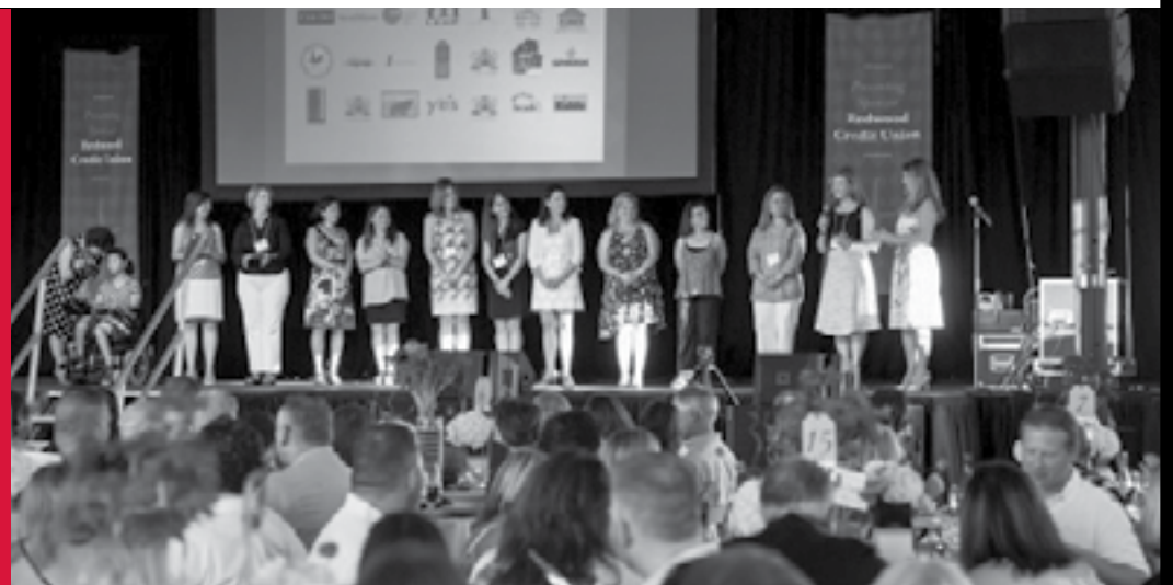
School district foundation leaders