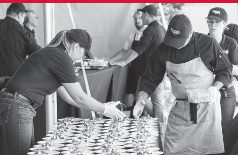
Nugget team busy preparing dinner for the 500 guests