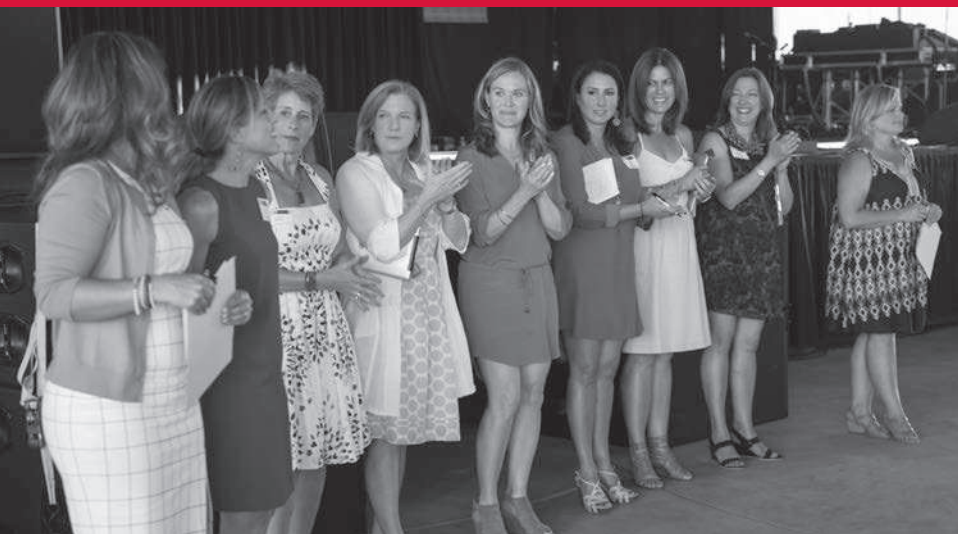
Marin County School District Foundation Leaders