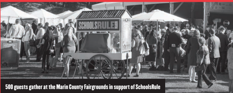
500 guests gather at the Marin County Fairgrounds in support of SchoolsRule