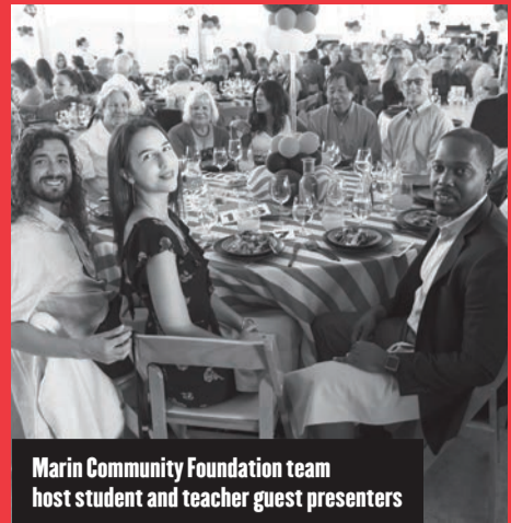
Marin Community Foundation team host student and teacher guest presenters