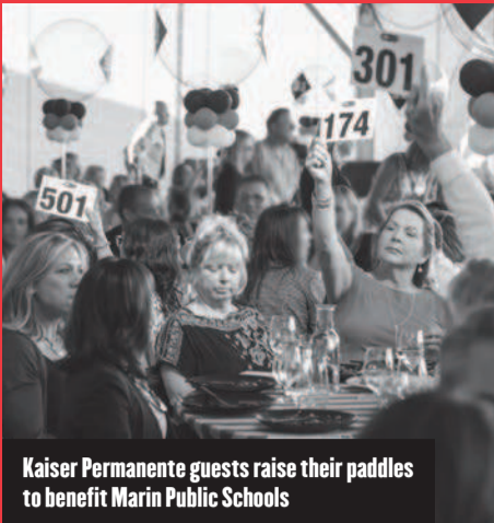
Kaiser Permanente guests raise their paddles to benefit Marin Public Schools