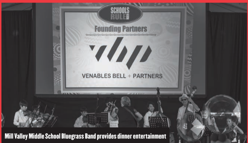
Mill Valley Middle School Bluegrass Band provides dinner entertainment

SchoolsRule is a cross-county organization working on behalf of every school district and every public school kid in Marin. All donations are divided on a per-student basis and distributed evenly throughout the county. On October 17th, we distributed a record $1M thanks to generous contributions of the people on this page who came out in support of SchoolsRule at our 7th annual signature fundraising event held this summer. We happen to think they rule.