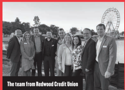
The team from Redwood Credit Union